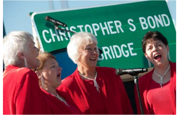
"From The Heart" quartet sings the National Anthem.