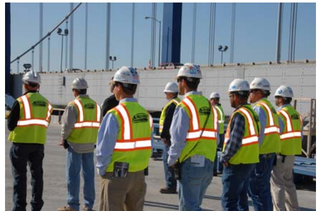
Paseo Corridor Constructor crews watch the pageantry.