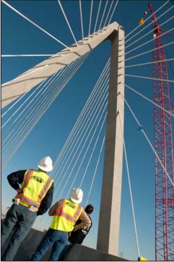
Onward and upward: cables radiate from the center pylon of the new, Christopher S. Bond Bridge.