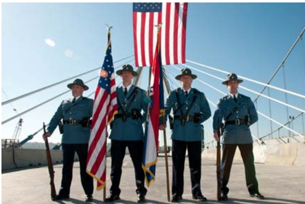
The Missouri State Highway Patrol Color Guard stands at attention prior to the ceremony's start.