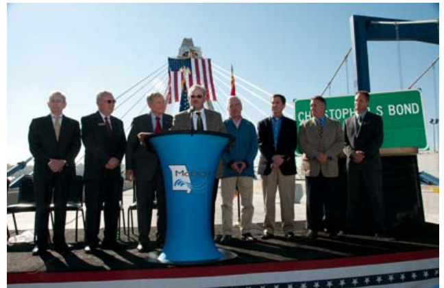
A surprise announcement is made – all Interstate 29/35 lanes, ramps to open by the end of this year – six months ahead of schedule.