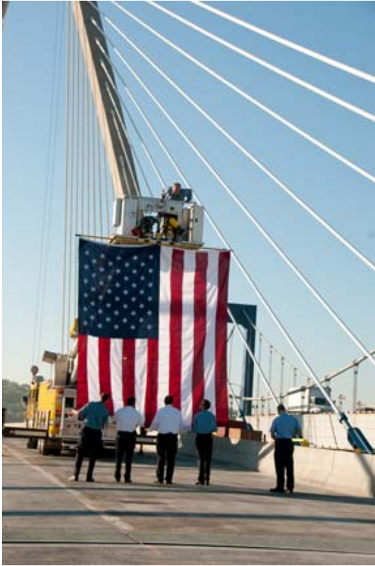
The North Kansas City Fire Department unfurls our Nation's flag.