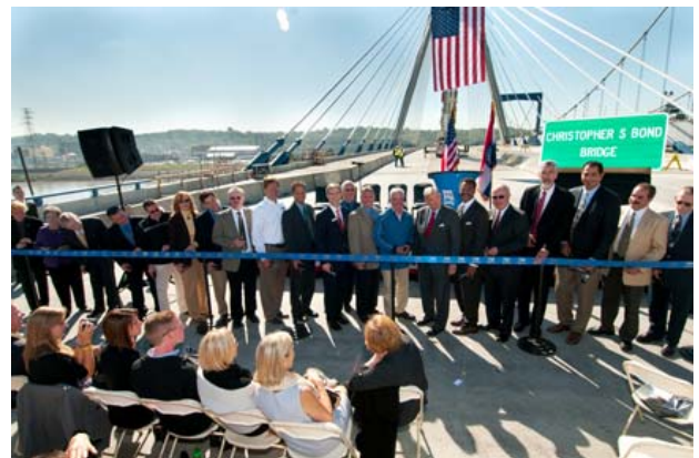
The ribbon is cut, opening the bridge deck.