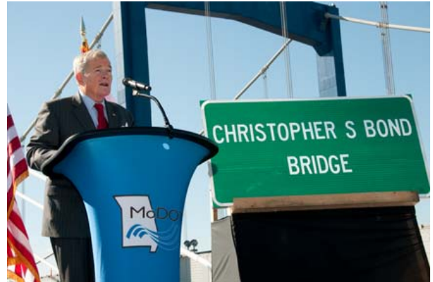
Sen. Kit Bond addresses the 700 ceremony attendees from the deck of his namesake bridge.